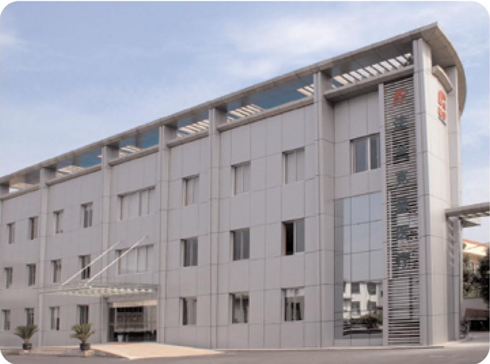
State-of-the-art manufacturing facilities.